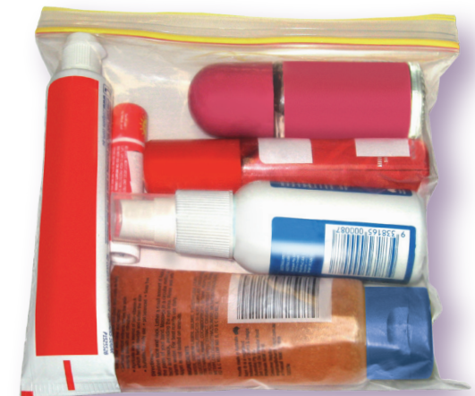
Size about 20 x 20cm